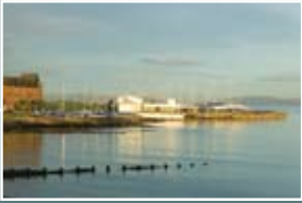
BALLYHOLME YACHT CLUB