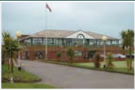
DONAGHADEE GOLF CLUB