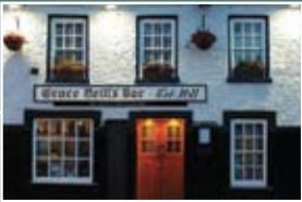
GRACE NEILL'S BAR