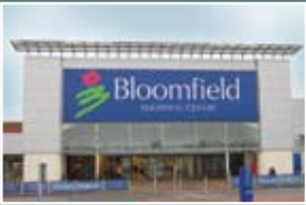
BLOOMFIELD SHOPPING CENTRE