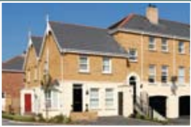
LINEYBROOK LANE (PREVIOUS DEVELOPMENT)