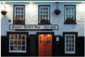
GRACE NEILL'S BAR