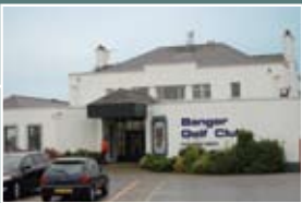
BANGOR GOLF CLUB